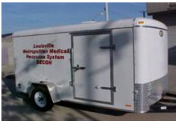
Trailers like this one have been placed throughout the region at local hospitals.

The MMRS program in Jefferson County along with its members work together to prepare for public health disasters. This is accomplished through planning, training, exercising, communicating and purchasing much needed equipment. MMRS allows regional public health and medical agencies to collaborate creating continuity throughout the region. We have placed emergency response equipment throughout the region. Equipment such as: