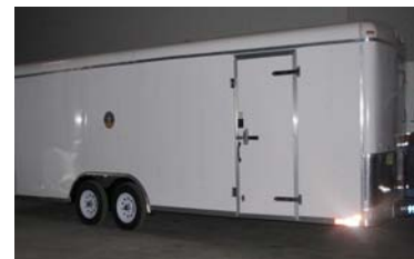
4 trailers full of equipment to each operate a 35 bed special needs shelter.

decontamination equipment, mass casualty incident equipment, equipment for the Special Medical Response Team, patient tracking equipment, special needs shelter/alternate care site equipment and much more.