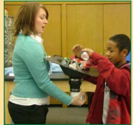
Student uses catch basin

Please feel free to copy any of this information for use at your local meetings or in your newsletters. Subscribe: Brightside@louisvilleky.gov . If you would like to be removed from this communication, e-mail Brightside@louisvilleky.gov with REMOVE in the subject line.