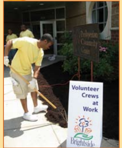
Volunteers help us keep Louisville looking clean, green and beautiful!