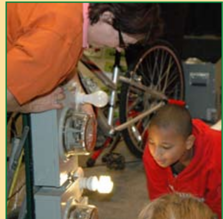
Students witness LCD requires less energy than incandescent bulb by watching the meter usage at the environmental youth summit