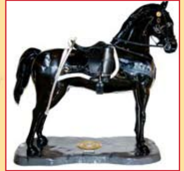
Black Jack by Flags4Vets

This ornament (shaped like an evergreen tree) is handmade from recycled, bio-degradable fibers and embedded with seeds. When planted, it will grow an Austrian Pine Tree! Call 502.574.2613 or email Brightside@louisvilleky.gov .