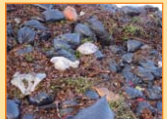
Use biodegradable bags for your yard waste to eliminate plastic